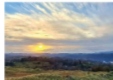
... meander through ...