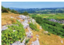
... Lakeland scenery