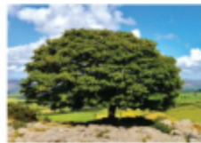
Gentle walks ...