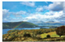
... stunning, tranquil ...